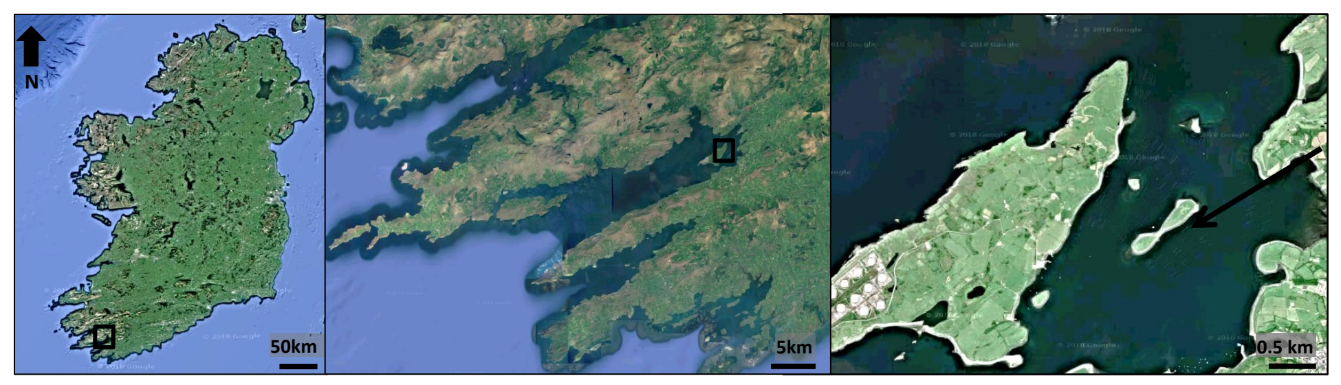
Figure 1: (a) ISPP test line site within Bantry Harbour