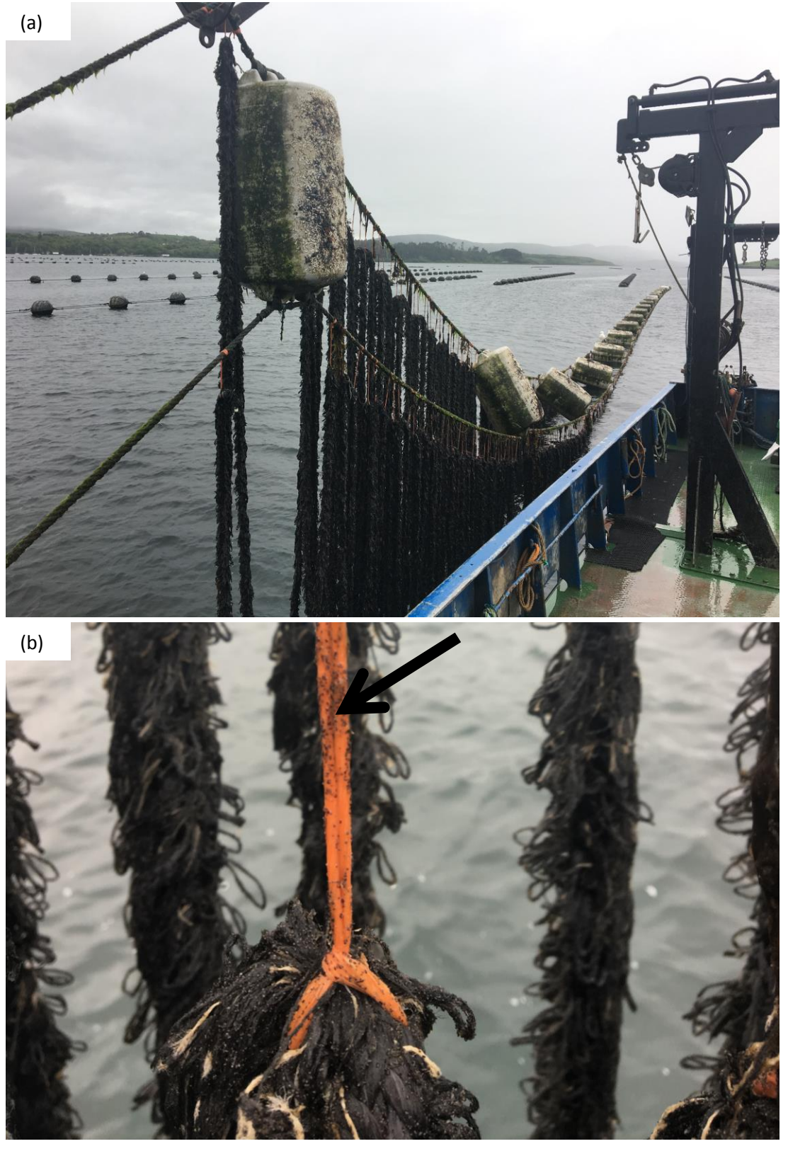
Figure 3: (a) ISPP test line raised for inspection. (b) Dense Mytilus spp. seed settlement above the rope (arrow).