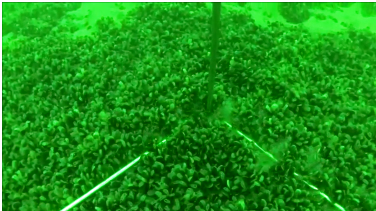
Table 3: Snapshot of the seabed between TC 23 and TC24

Grabs were taken randomly on the settlement and the average weight across was 500 g of seed per grabs (varying from 190g to 950g of seed per grabs, see details on map). Therefore the tonnage has been estimated to be between 3500 and 4000 tons at the time of the survey. The density looked higher on the south part of the bed.